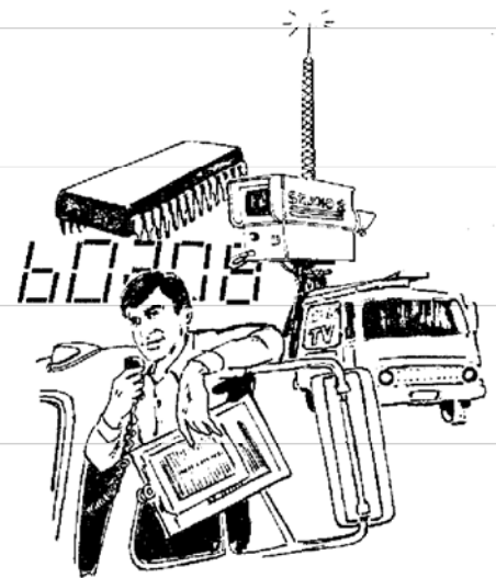
FC51 1 GHz Frequency Counter

Covers 10 Hz through 1 GHz continuously at better than FCC requirements all the way: Super-accuracy of .5 parts per million, with a maximum of 2 PPM change per year, from 0 to 40°C, means that you will be within FCC specs at all times. Kept accurate by proportionately-controlled oven.